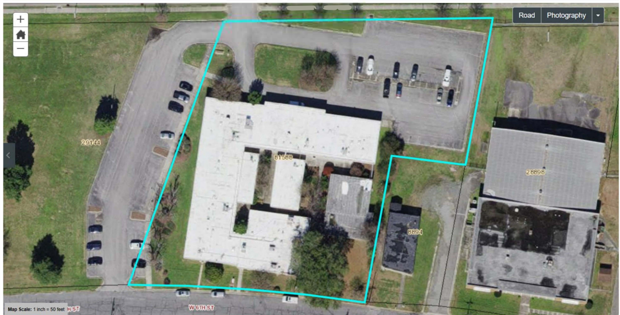
East Carolina University Medical Pavilion Complex 1800 W. Fifth Street