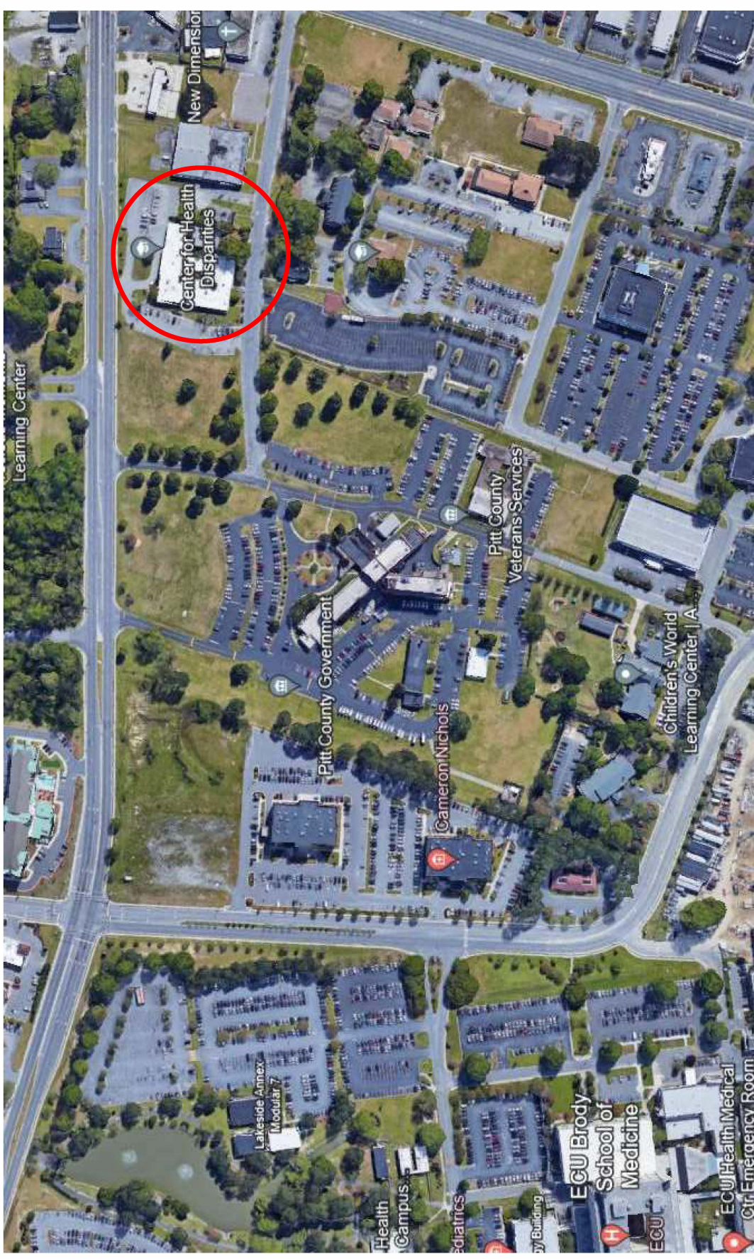
GENERAL LOCATION MAP