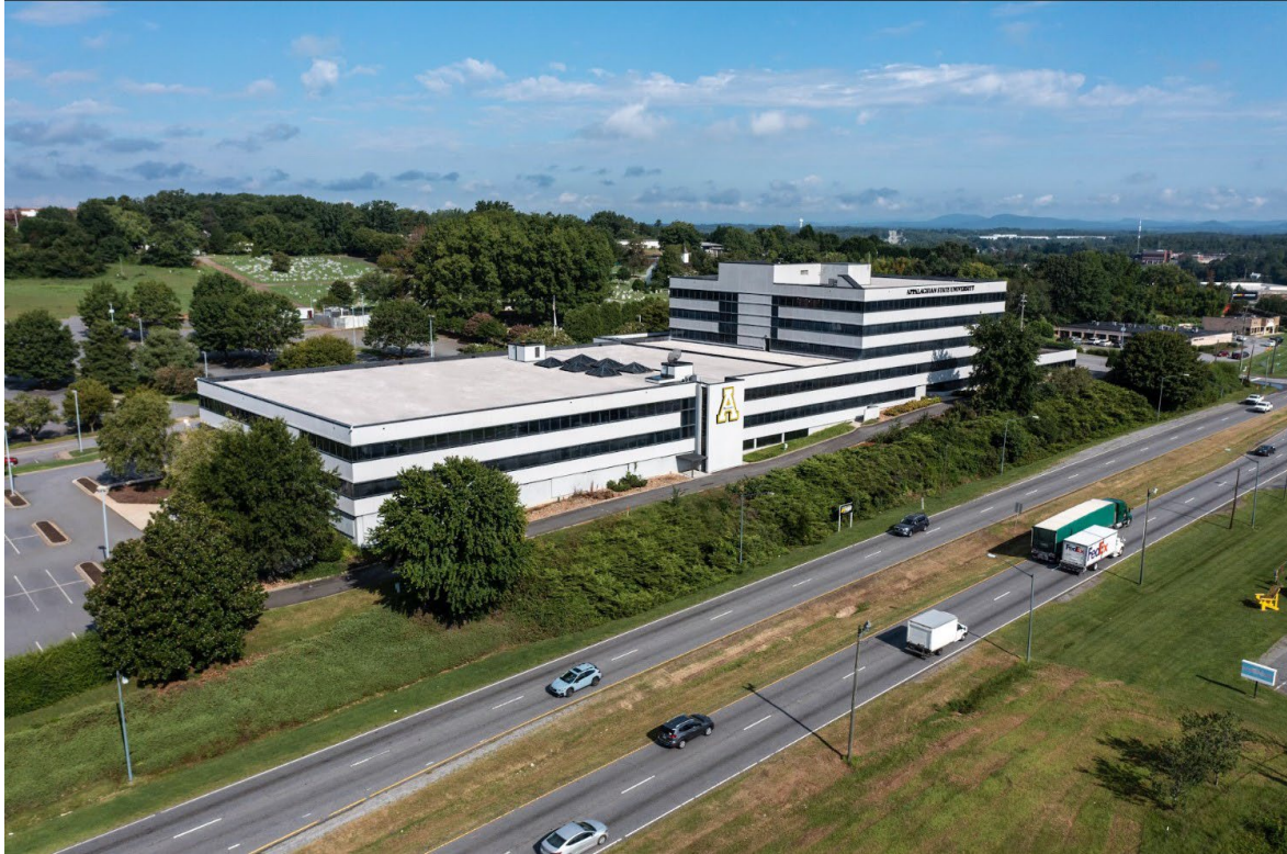
FIGURE 1: BUILDING ELEVATIONS