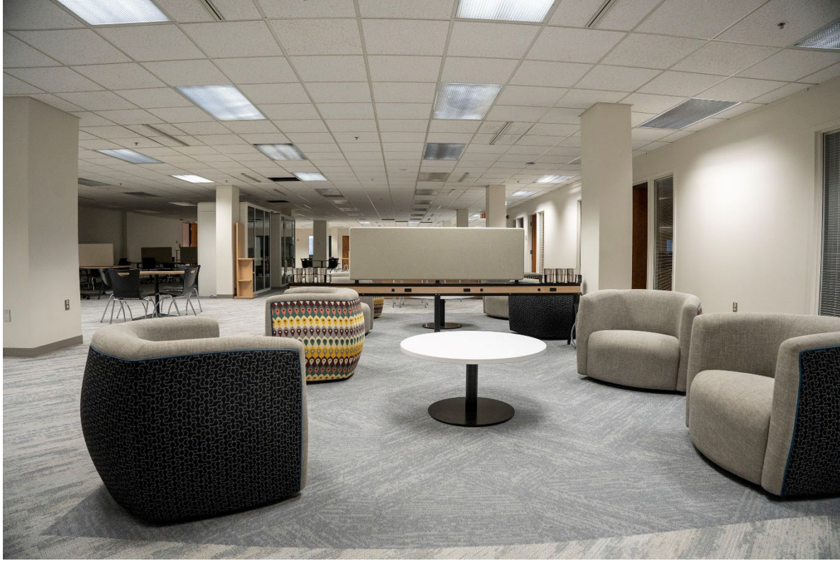
FIGURE 3: STUDENT COMMONS AREA & MEDIA CENTER