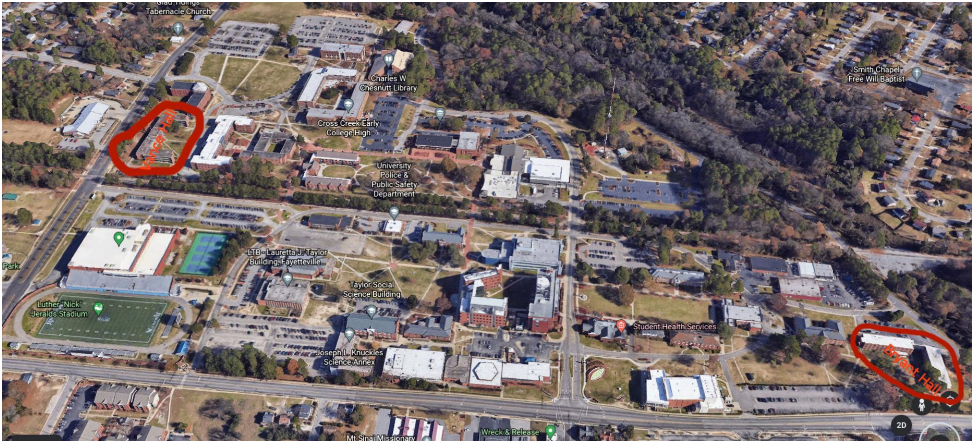
Campus Map showing locations of Bryant Hall and Vance Hall