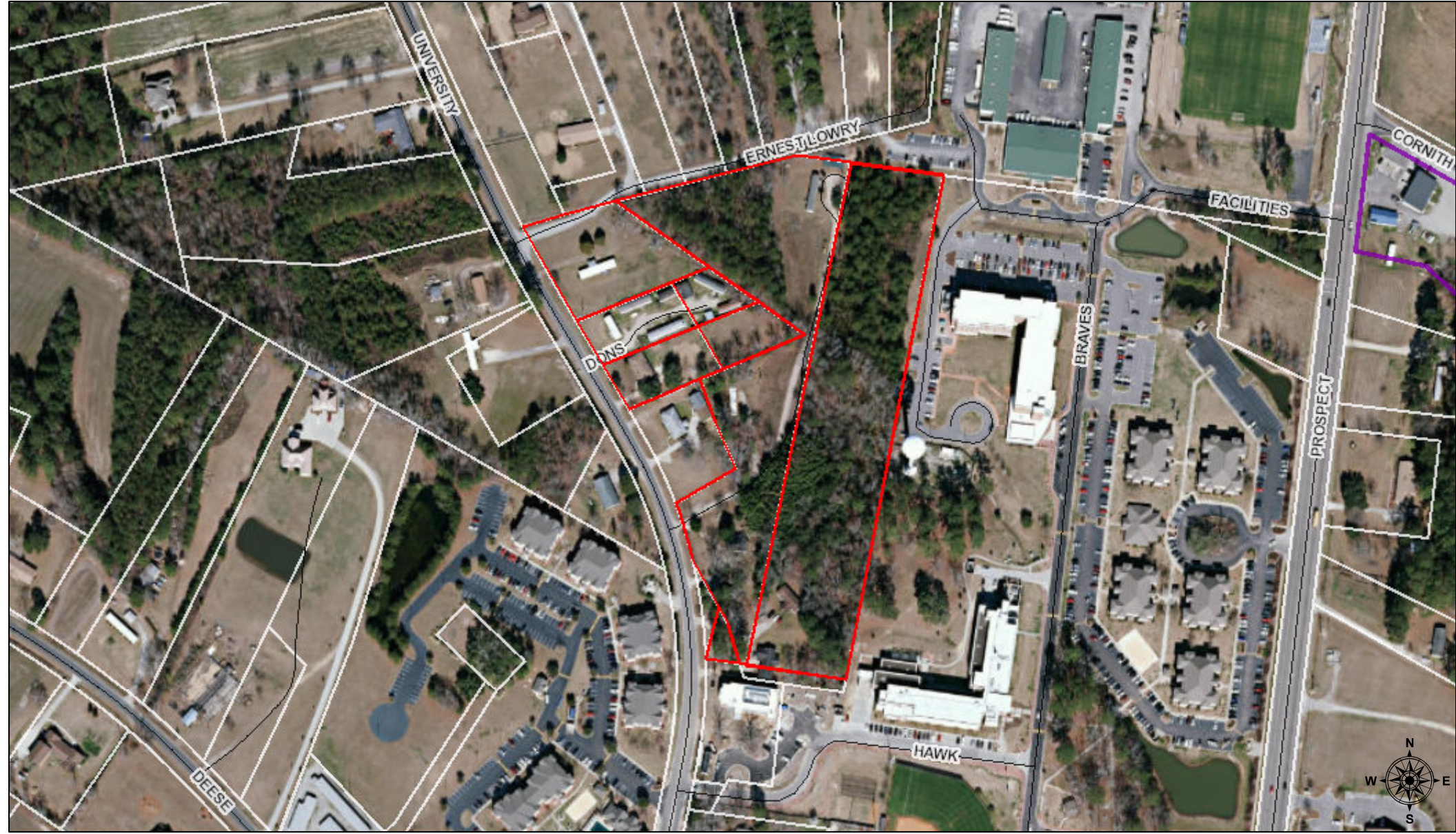
The Lodge at Pembroke