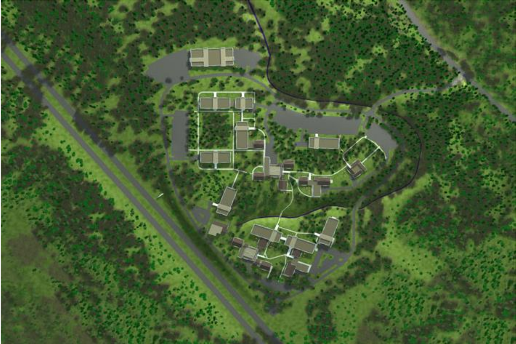
GATEWAY RESEARCH PARK – NORTH CAMPUS BROWN SUMMIT, NC