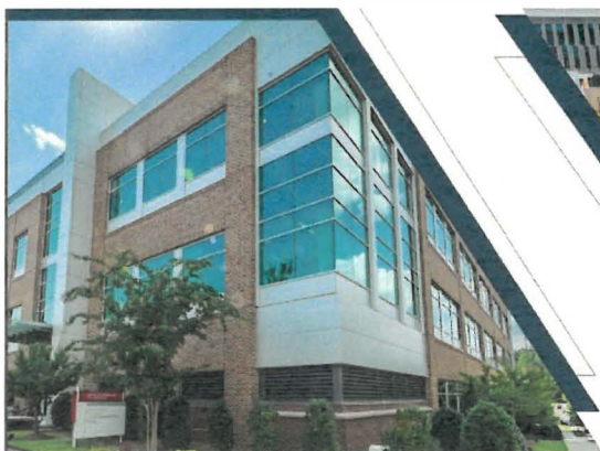
1010 Main Campus Drive Centennial Campus, Raleigh, NC 27606

Center for Technology and Innovation (Centennial Campus)