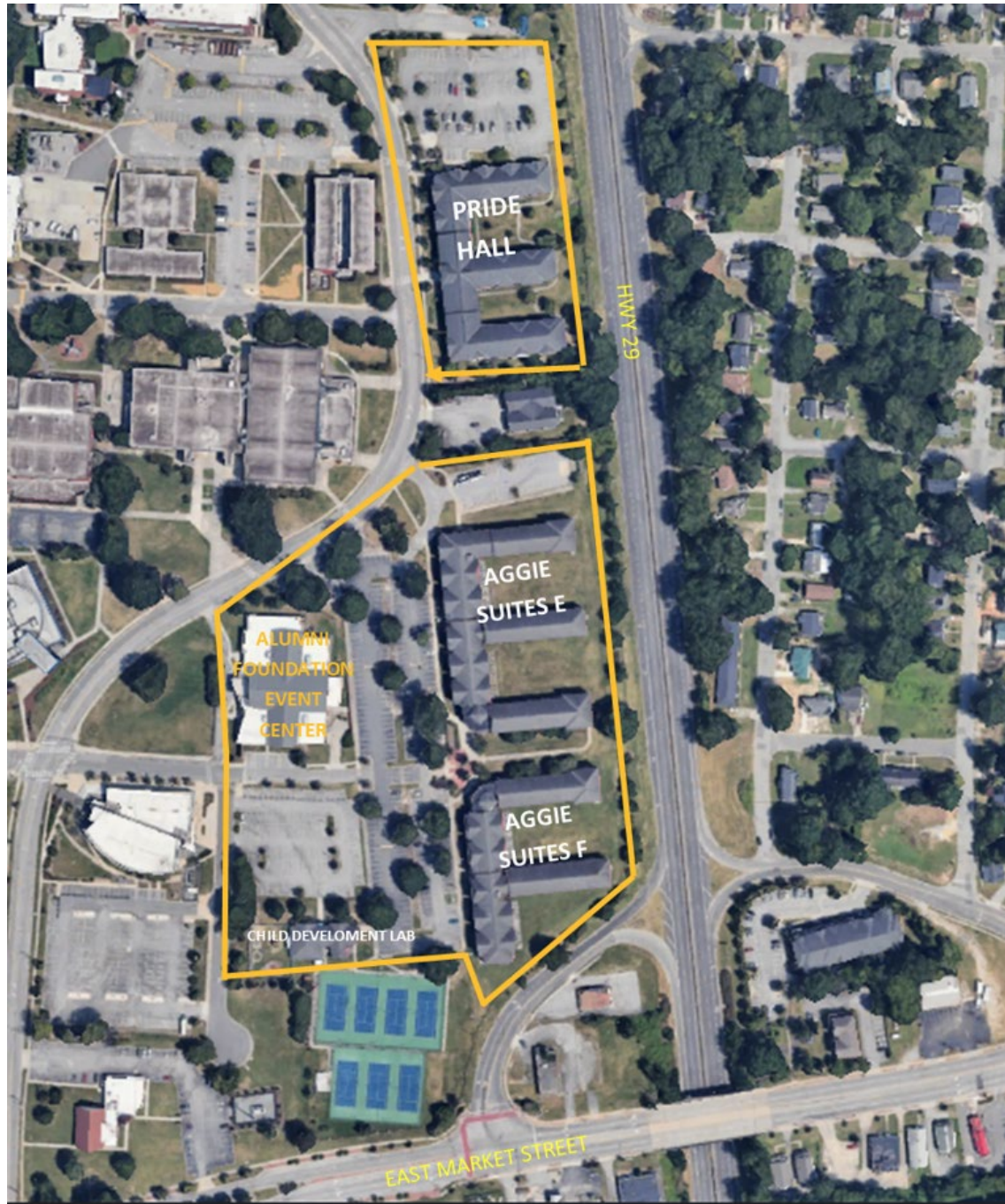
ATTACHMENT B – UNIVERSITY PROPERTY