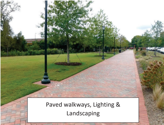
Paved walkways, Lighting & Landscaping