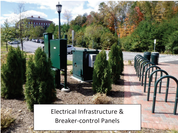
Electrical Infrastructure & Breaker-control Panels