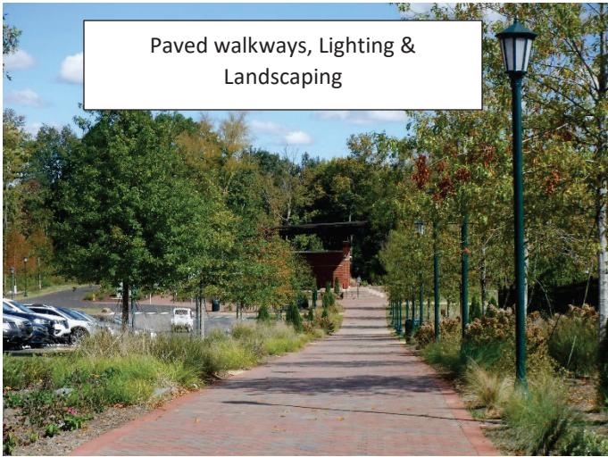
Paved walkways, Lighting & Landscaping