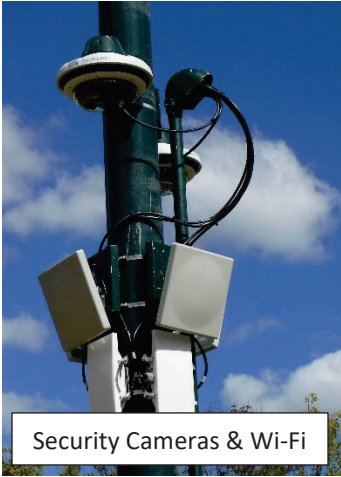
Security Cameras & Wi-Fi