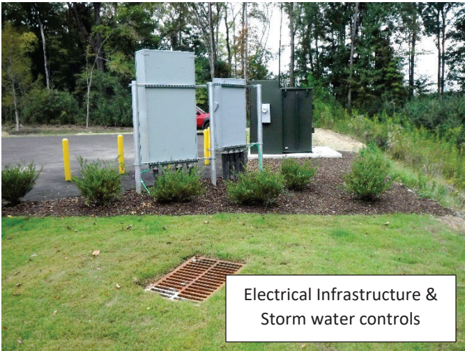
Electrical Infrastructure & Storm water controls