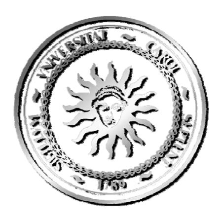
BOG Policy Discussion June 14, 2012