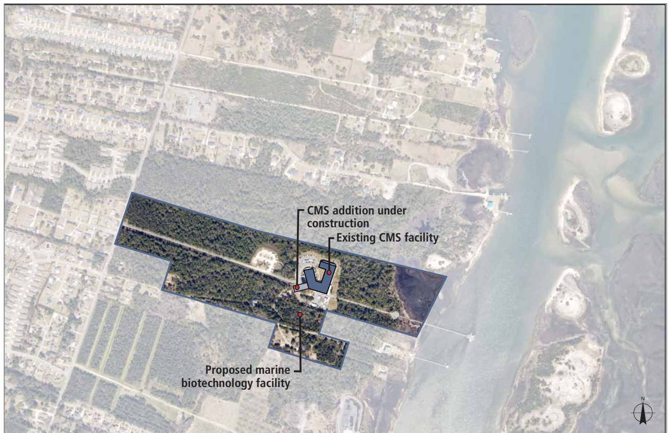
Proposed SOUTH CREST Site: Myrtle Grove